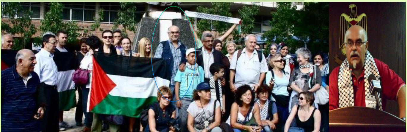
These picture were taken on September 2016